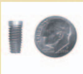
Relative size of an actual dental implant.