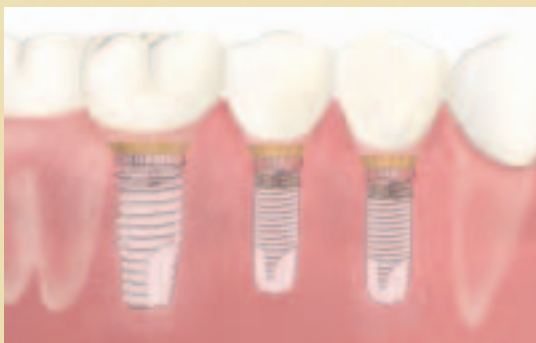
Multiple missing teeth replaced with dental implants and implant crowns.

If you are missing some of your natural teeth, your dentist may recommend dental implants to replace the roots of the missing teeth and implant crowns to rebuild your teeth in a beautiful and natural looking manner. Compared to other treatment options to replace missing teeth, such as bridges and removable partials, implants with implant crowns offer a long-lasting solution for missing teeth and require fewer follow-up office visits.